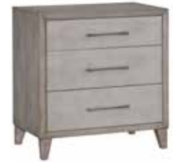
175-350 Three Drawer Nightstand 28W x 17D x 29H Shown on page 10