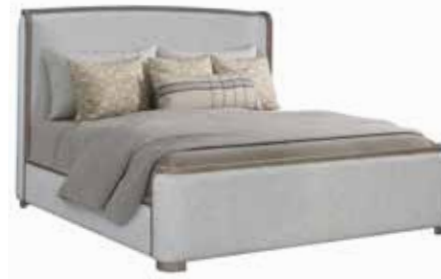
175-250/-251/25PR Queen Wood & Uph Bed 67W x 87D x 56H