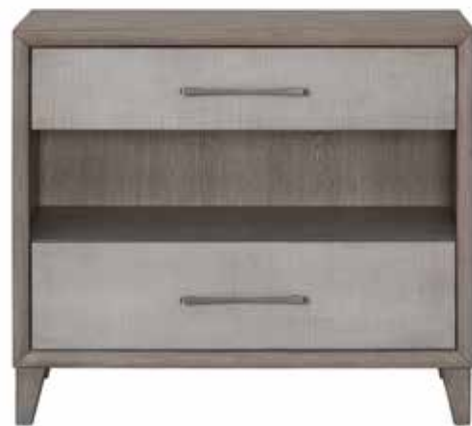
175-352 Two Drawer Nightstand 34W x 17D x 29H Includes USB/USBC ports.