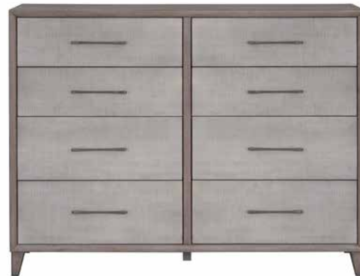
175-170 Eight Drawer Chest 60W x 19D x 45H