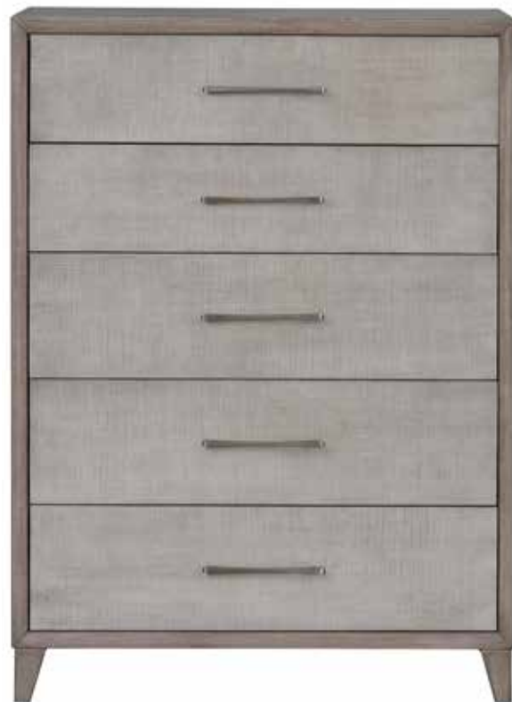
175-150 Drawer Chest 38W x 19D x 52H