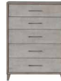
175-150 Drawer Chest 38W x 19D x 52H Shown on page 8