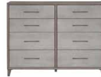
175-170 Eight Drawer Chest 60W x 19D x 45H Shown on page 8