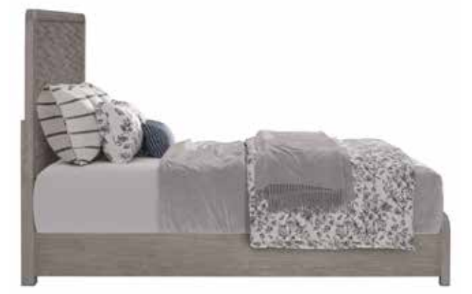
175-250/-251/25PR Queen Wood & Upholstered Bed 67W x 87D x 56H *Available as headboard only.