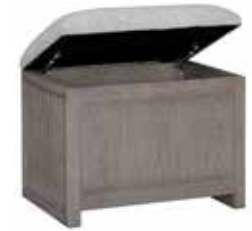
175-380 Storage Bed Bench 26W x 19D x 21H Shown on page 10