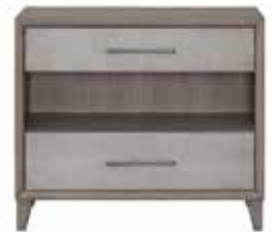
175-352 Two Drawer Nightstand 34W x 17D x 29H Shown on page 10