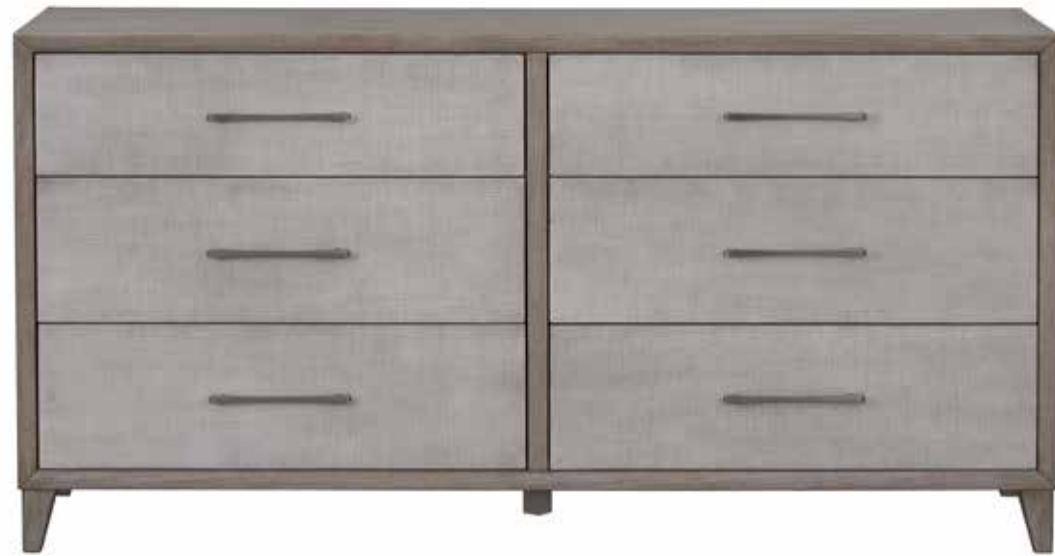
175-140 Six Drawer Dresser 68W x 19D x 36H