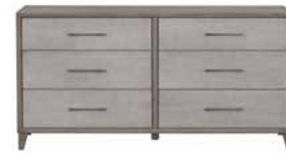
175-140 Six Drawer Dresser 68W x 19D x 36H Shown on page 8