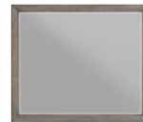
175-06M Landscape Mirror 48W x 2D x 41H Shown on page 9