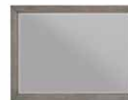
175-07M Landscape Mirror 44W x 2D x 33H Shown on page 9