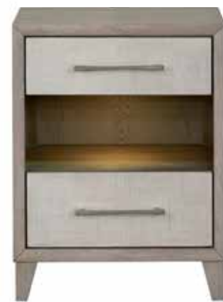
175-355 Small Two Drawer Nightstand 22W x 17D x 29H Includes USB/USBC ports.