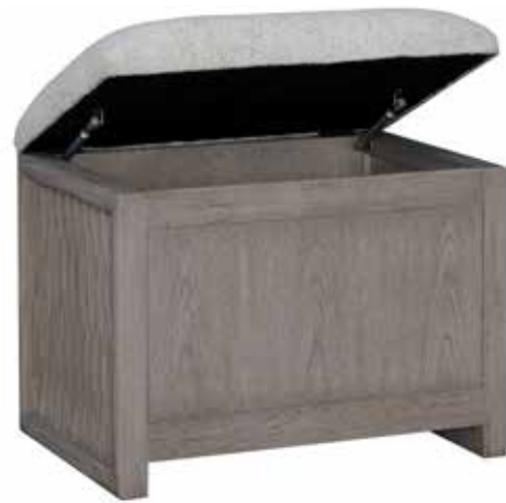
175-380 Storage Bed Bench 26W x 19D x 21H