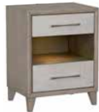
175-355 Small Two Drawer Nightstand 22W x 17D x 29H Shown on page 10