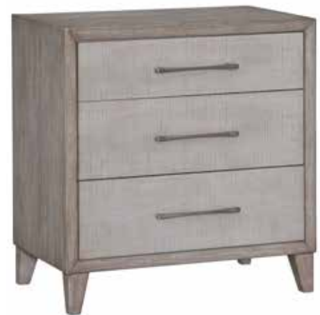
175-350 Three Drawer Nightstand 28W x 17D x 29H Includes USB/USBC ports.