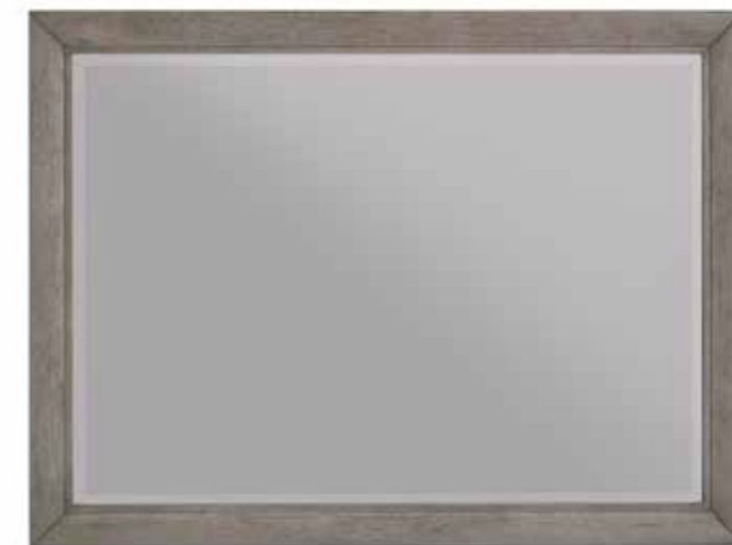
175-07M Landscape Mirror 44W x 2D x 33H