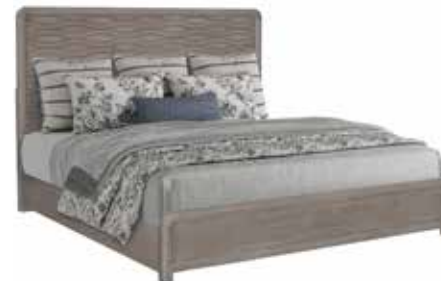
175-230/-231/-20R Queen Wood Bed 67W x 86D x 56H